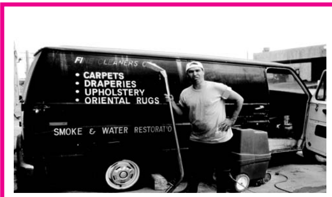
BUBBA – THE WORLD’S MOST NOTORIOUS CARPET CLEANER!

Bubba is a fictional character that represents The Uneducated, Uninformed, and Sometimes Downright Unscrupulous Carpet Cleaners of The World. He is to be avoided at all cost!