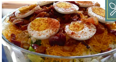
Amazing layered salad with a super creamy sour cream dressing. Loved making this salad! I had not made this since the 80s. Delicious with a bit of nostalgia thrown in!

What has more letters than the alphabet? The post office!