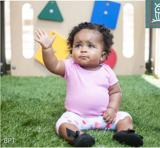
BPT Pets are well taken care of, since 85% of dog or cat owners take action to safeguard pets from ticks in some way, such as a tick collar.

Did you know pet owners are nearly three times as likely to protect their pets from ticks than to protect themselves? Most Americans know ticks typically live in wooded areas, yet only half know ticks can live in suburban backyards! Here are tips to help you keep these pests at bay.