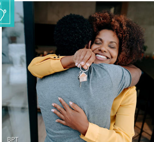
BPT Following years of low mortgage interest rates, 2023 and early 2024 saw rates fluctuate between 6% and 8%, complicating some home buyers plans, particularly those looking to purchase their first home.

There is a saying, "date the rate, marry the home." Borrowers should stay within their budget, but those who purchase a home now with a low down payment can start building equity, avoid other borrower's competition, and may be able to refinance later when rates decrease.