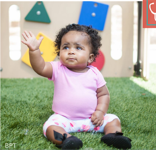
BPT It's difficult to distance ourselves from screens; but parents need to make sure their children are experiencing a well-rounded mix of free play, both inside and outside, along with technology usage.

Evidence suggests that even television shows claiming to be stimulating and educational are not as effective for infants and toddlers as face-to-face interactions with a caregiver. Too much screen time has also been linked to poor sleep, delays in language and social skills, obesity, behavior problems and more.