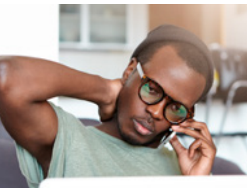
Don't just take their word for it. Ask the appropriate questions.

But you can identify an actual debt collector with three simple questions, according to thesimpledollar.com :