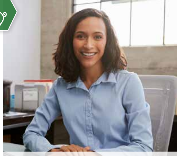
29% of all business owners in America are women

Women entrepreneurs should seek out other women to partner with and learn from. They should strive to build their customer base by actively marketing and emphasizing their unique talents and abilities.