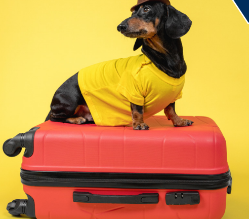
If you are traveling across state lines, talk to your vet before you leave. Some states require a health certificate if you're visiting for more than 10 days.

Don't pack light: Bring your pet's own food, water (if possible), and toys when traveling, to ease anxiety. Travel with an assortment of entertainment to keep your pet's mind busy such as catnip toys for cats, and tug toys, ice cubes or a frozen Kong with peanut butter inside for dogs. Additionally, make sure to pack any of your furry friend's medications, light bandage material, roll gauze, medical tape, topical triple antibiotic ointment and eye wash for emergencies.