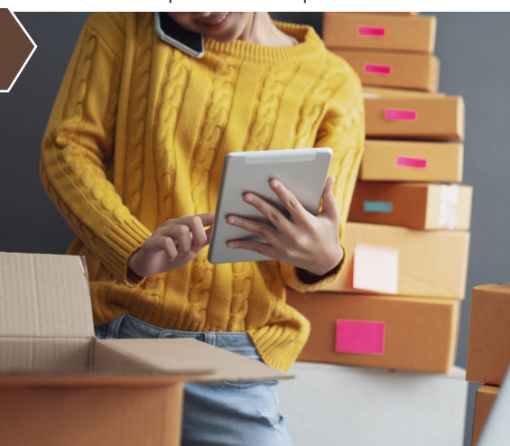
If a meet-up is necessary to complete the sale, opt for a well-lit public location with video surveillance - and keep a safe, social distance. Search on safetradespots.com for a location that works for everyone.

Check shipping before you buy – Stay safe by choosing to ship your bought or sold items. Make sure the app you are using offers nationwide shipping. When buyers see an item they like, they can choose to receive the item by mail, make their offer and pay through the app. Sellers receive a prepaid shipping label and both parties can track the shipping process.