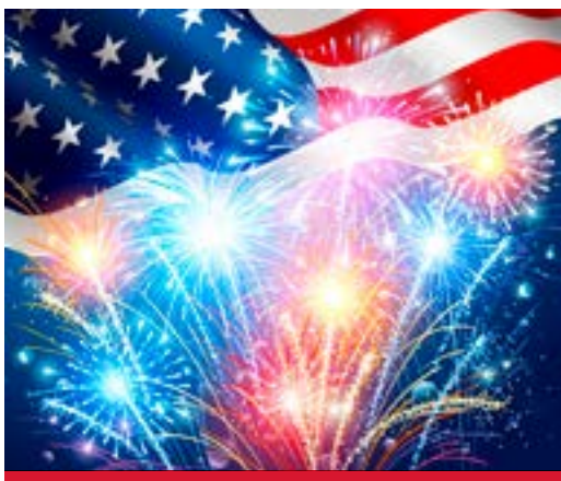
This Independence Day, remember those who made it possible.

If you suspect that you have a carpet beetle problem or want to avoid one, call Chet's Cleaning so that we can clean your carpet, upholstery and drapery. That is a logical first step to eliminating these destructive invaders.