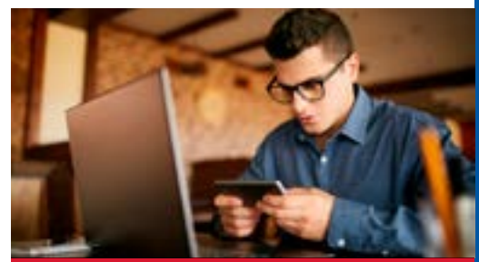
Be careful using free wi-fi. Just becausse it's free, doesn't mean it's safe.

Because airbags stop the body, they prevent deadly head injuries and whiplash. But they do sometimes cause red impact burns on the body and break eyeglasses.