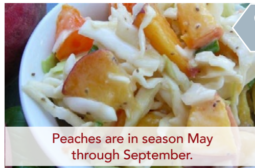
Peaches are in season May through September.

Why are gulls named seagull? If they were by the bay, they'd be bagels!