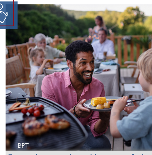
Few products come in as wide an array of price ranges as grills, so almost anyone who wants a grill can find one that's within their budget.

Kamado : For people who love cooking all styles and grilling year-round, Kamado Grills' excellent insulation works perfectly for both grilling and smoking. They're very versatile, use wood and charcoal, and can also roast or bake.