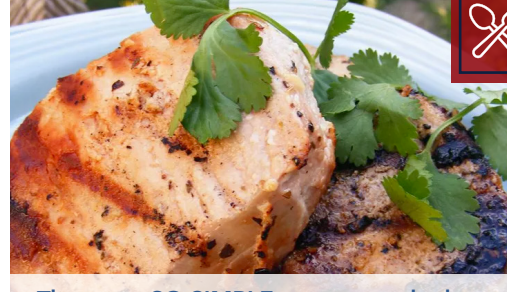
These are SO SIMPLE, yet so good - they taste just like steak! The chops can also be broiled in the oven.