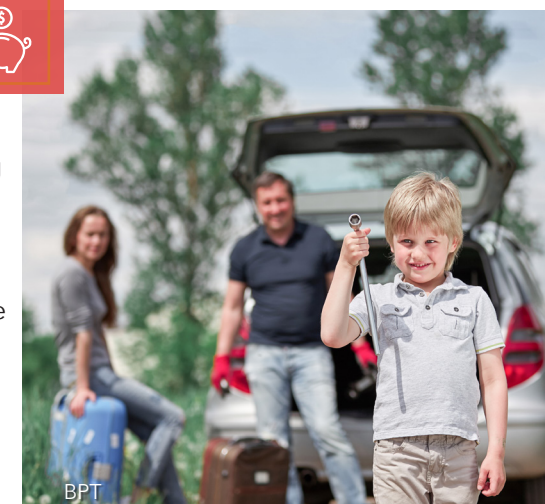
It's bad enough to suffer a mechanical problem in any situation, but dealing with a breakdown halfway to the family cabin is something no one wants to experience.

Turn to a professional when the time is right - but don't wait too long! 1 in 3 Americans say they feel safer getting maintenance done by a professional. But it's important to remember that professional maintenance visits need to be scheduled every 3,000 miles or six months - whichever comes sooner.