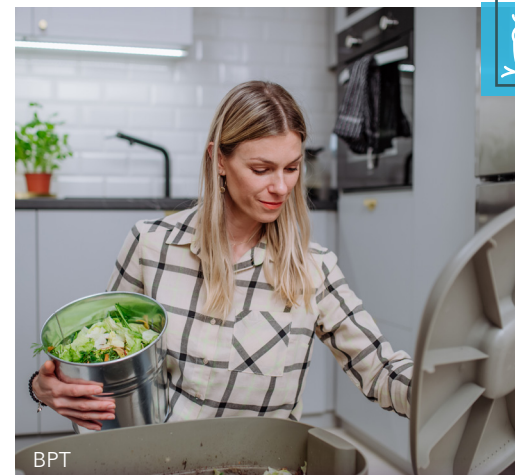
One key way to make a lasting impact in protecting the planet is by investing in a sustainable home, from energy-saving laundry appliances to composting for less food waste.

5. Keeping it fresh and reducing food waste - Americans toss roughly over $3,000 of spoiled food annually! Buying a fridge with more useful storage capabilities and purposeful organization will contribute to less food waste overall, keeping groceries fresher for longer.