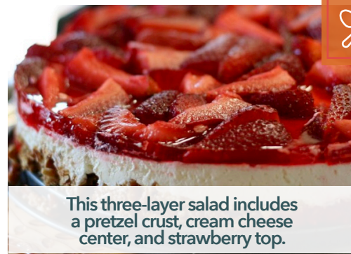
This three-layer salad includes a pretzel crust, cream cheese center, and strawberry top.

What nails do carpenters hate hammering? Fingernails.