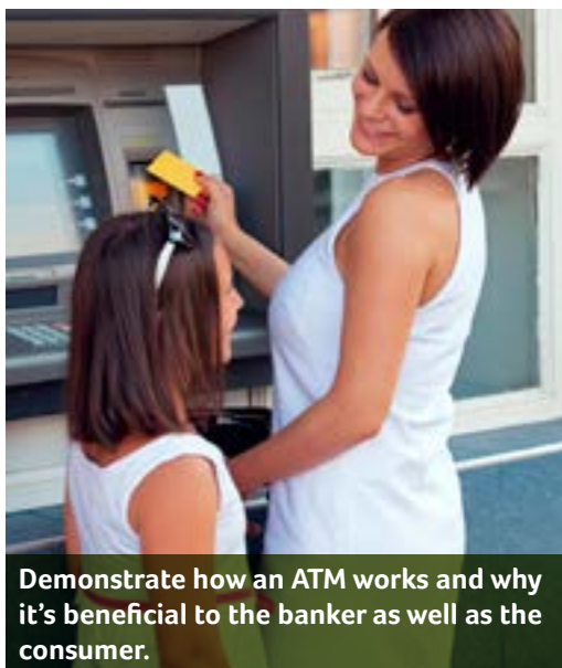
Demonstrate how an ATM works and why it's beneficial to the banker as well as the consumer.

Most bulbs prefer a 45 to 55 degree temperature range. Begonias, gladioli, and cannas prefer 50 to 60 degrees.