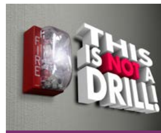
Ignoring a fire drill can be a life changing decision.

While this was an exceptionally tragic case, blocked exits and locked doors are possible to find in any location. Usually, these situations are easy to remedy and