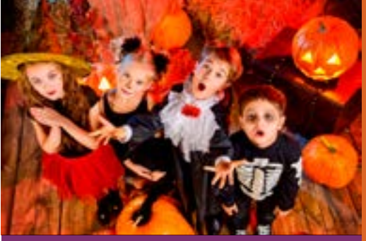
Take time to teach your children how to have a fun, but safe Halloween.

The Harvard research team did not find much of a difference in risk of heart