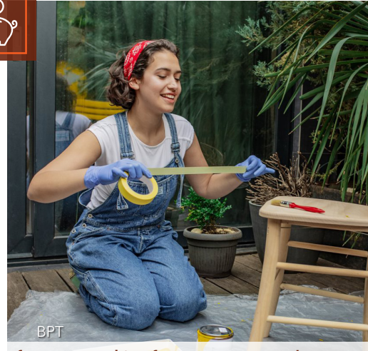
If you're searching for new ways to make a positive impact on the planet, considered how you buy furniture. By opting for pre-owned or used furniture you can save money, plus it reduces waste, contributing to a more sustainable future.

Get creative: You can paint or refinish a piece to give it new life or mix and match styles for a unique look.