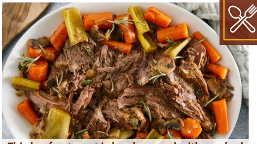
This beef pot roast is lovely served with mashed potatoes. The real secret here is making sure you sear the meat before the long, slow braise.