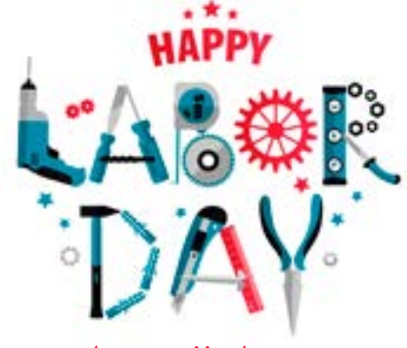
from all of us at CHET'S CLEANING